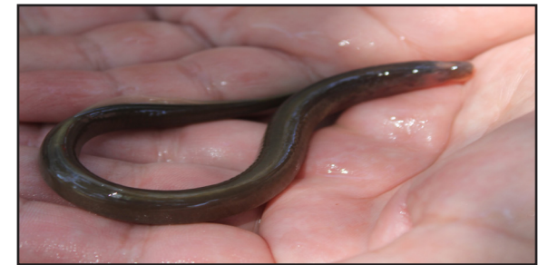
Kern Brook Lamprey Lampetra hubbsi