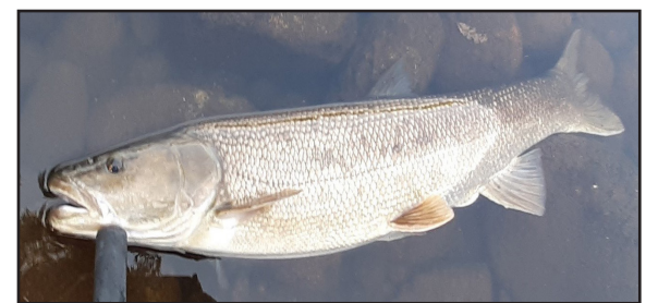
Sacramento Pikeminnow Ptychocheilus grandis