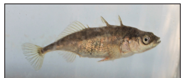
Three-spine Stickleback Gasterosteus aculeatus