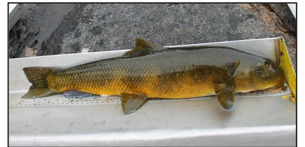
Sacramento Sucker Catostomus occidentalis