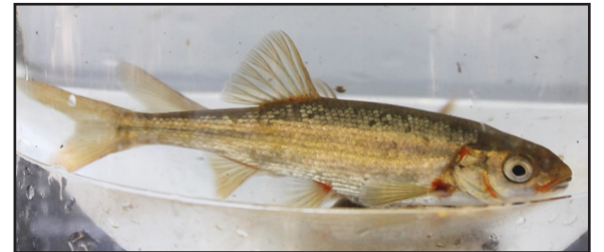
California Roach Lavinia symmetricus