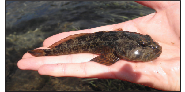
Prickly Sculpin/ Riffle Sculpin Cottus asper/ Cottus gulosus