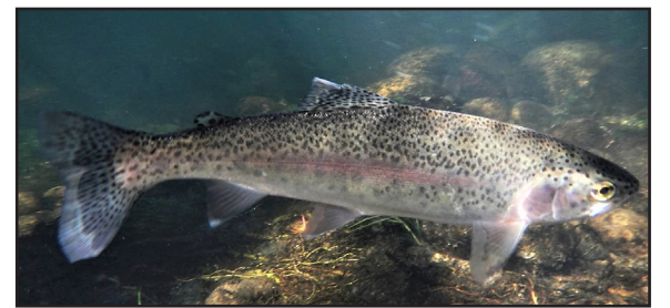
Rainbow Trout Oncorhynchus mykiss